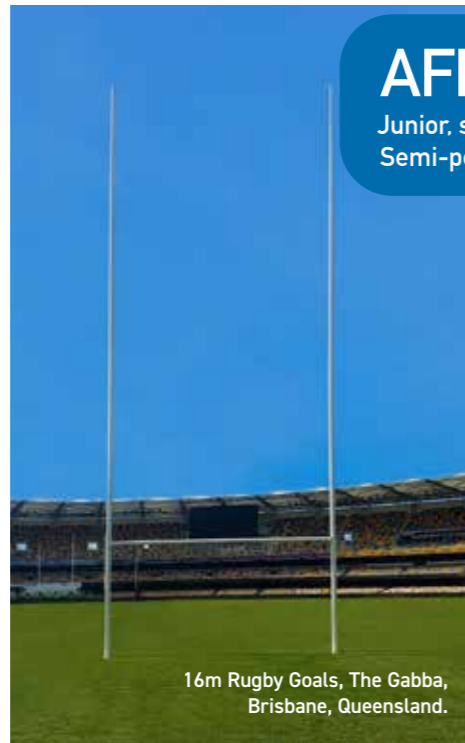
16m Rugby Goals, The Gabba, Brisbane, Queensland.