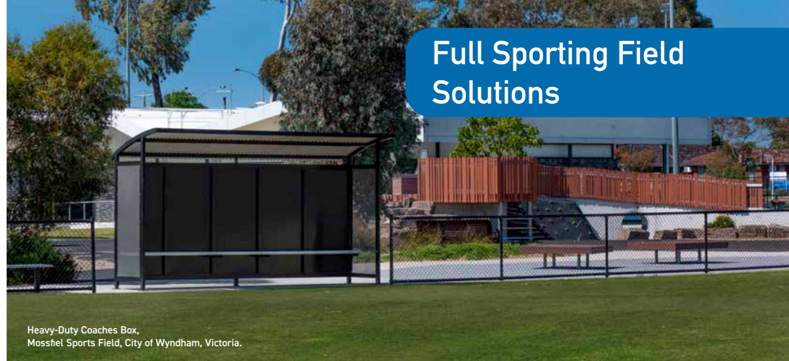
Heavy-Duty Coaches Box, Mossfiel Sports Field, City of Wyndham, Victoria.