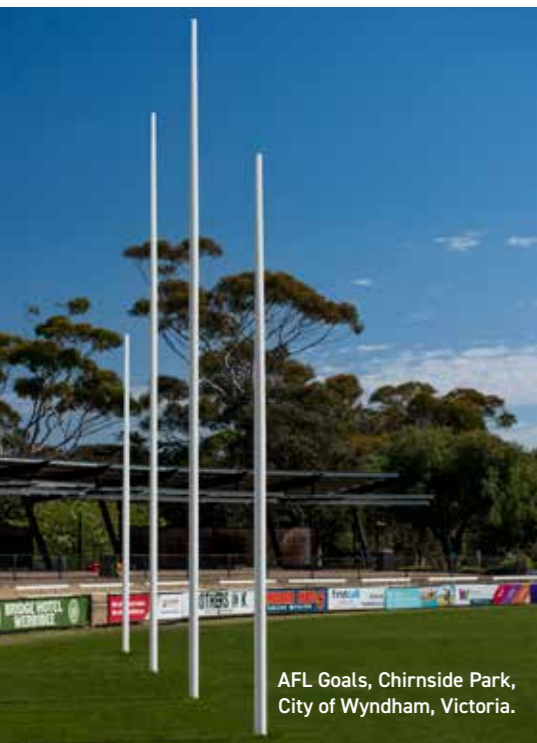
AFL Goals, Chirnside Park, City of Wyndham, Victoria.