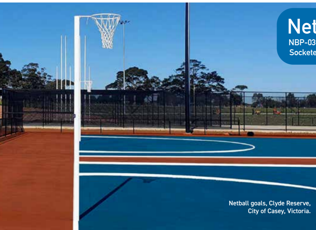
Netball goals, Clyde Reserve, City of Casey, Victoria.