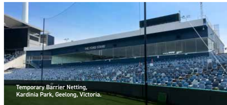
Temporary Barrier Netting, Kardinia Park, Geelong, Victoria.