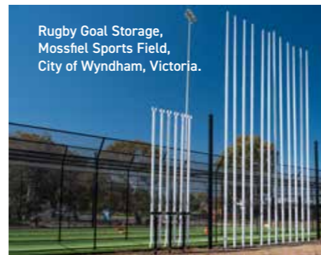
Rugby Goal Storage, Mossfiel Sports Field, City of Wyndham, Victoria.