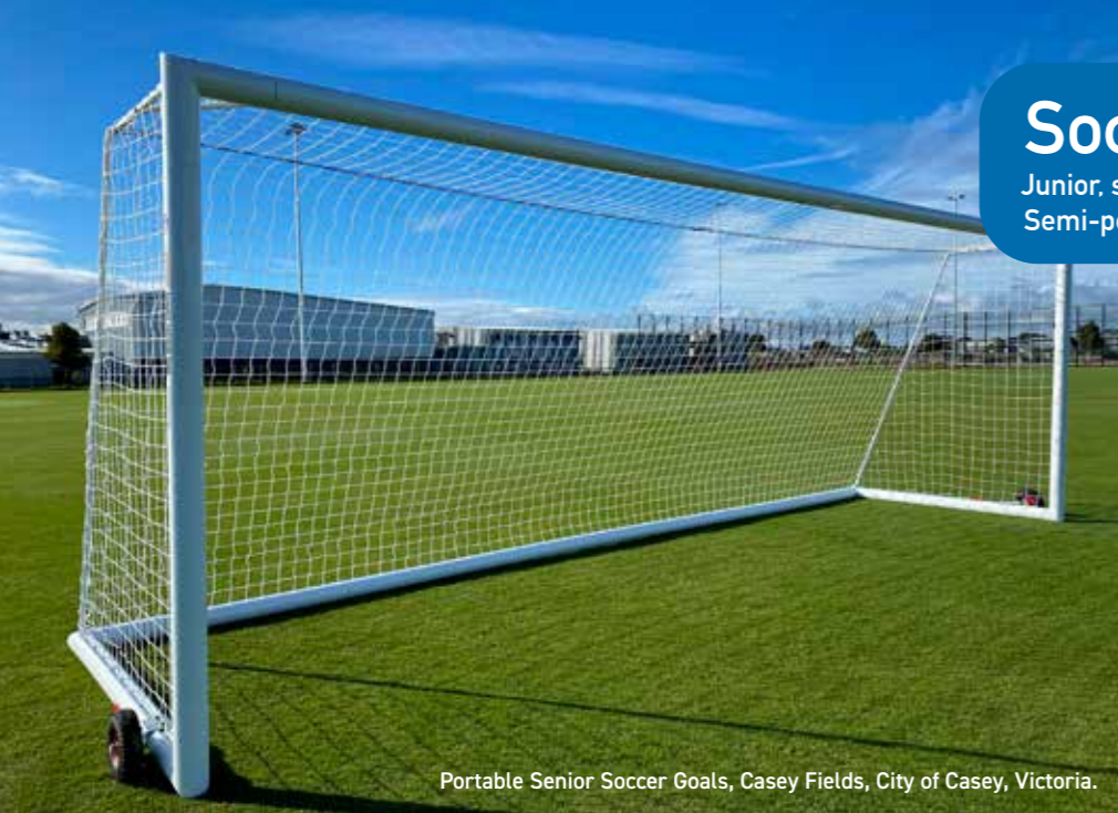
Portable Senior Soccer Goals, Casey Fields, City of Casey, Victoria.