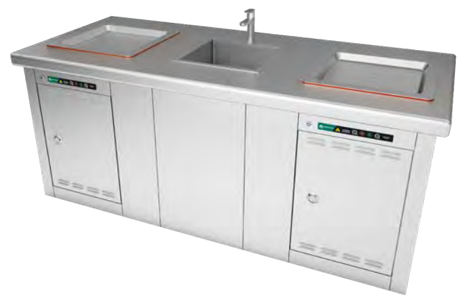
MATILDA TRIPLE STAND ALONE UNIT - TWO BBQ AND SINK OPTION

*Please Note, Bench Weights do not include BBQ's.