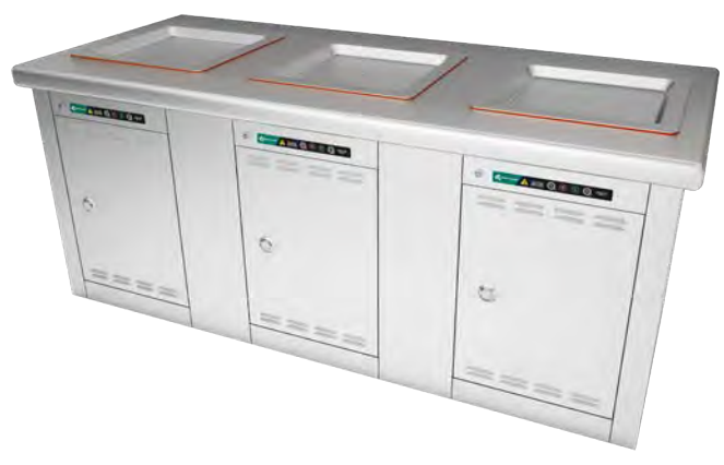
MATILDA TRIPLE STAND ALONE UNIT LENGTH - 2096mm HEIGHT - 870mm WIDTH - 902mm WEIGHT - 170KG

All Matilda Cabinets are supplied with Greenplate's Patented Inbench Electric Barbecues. Well suited for communities of all requirements including gated residences and caravan parks but tough enough for use in inner city parks and other open spaces.