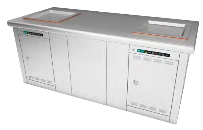
MATILDA TRIPLE STAND ALONE UNIT - TWO BBQ OPTION