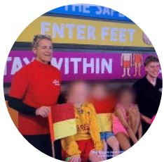
Water Safety with Derrimut Weelam Gathering Place (DWGP) City of Kingston