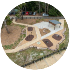
Merricks Station Ground Reserve Activation Mornington Peninsula Shire