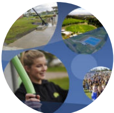
Open Space Strategy & Active Cardinia Strategy Cardinia Shire Council, insideEDGE Sport and Leisure Planning + Mosaic Insights