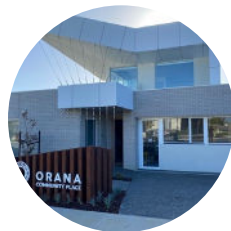
Orana Community Place City of Casey