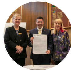
Historic Joint Council Meeting Hume City Council, Mitchell Shire Council + City of Whittlesea