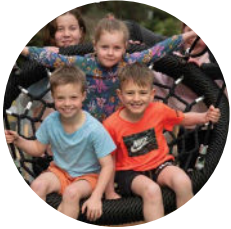
Play Your Way Strategy Kingston City Council