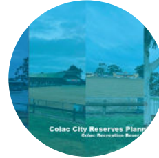
City Reserves Planning Project Colac Otway Shire Council