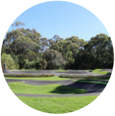
Wesburn Pump Track Yarra Ranges Shire Council