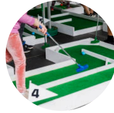
Family Golf Event Maribyrnong City Council + Golf Australia