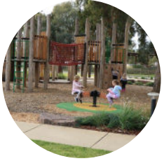
Celebrating All Abilities in Kerang Gannawarra Shire Council