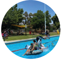
Free Youth Pool Entry Pilot Aligned Leisure