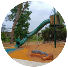
Growing rural communities and tourism within the King Valley Rural City of Wangaratta