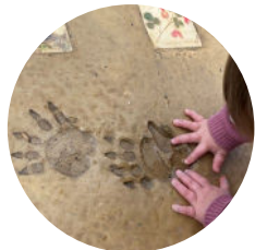
Cororooke Open Space Colac Otway Shire Council