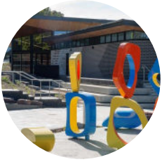
Henry Turner South Reserve Pavilion Redevelopment Maribyrnong City Council