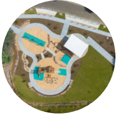
Olivia Way Hastings Playground Mornington Peninsula Shire