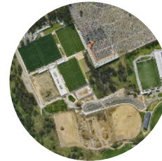
Designing Elite Soccer Fields of Play for the Home of the Matildas SPORTENG