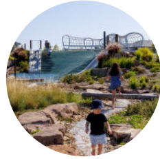
Banjo Park ASPECT Studios