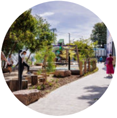
Jean Street Reserve and Garfield Lane Park + Safety Upgrades Kingston City Council