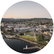
Devonport Waterfront Park (Haines Park) ASPECT Studios