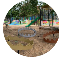
Princes Park Playspace Upgrade Glen Eira City Council