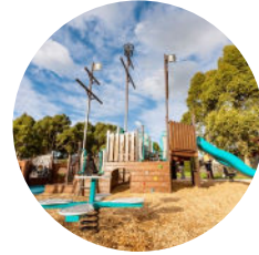
Creekwood Park Pakenham Cardinia Shire Council + Victorian State Government