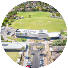
Murrumbeena Park Community Hub Glen Eira City Council