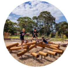
Elder Street South Reserve Kingston City Council