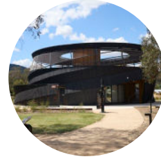
Ned Kelly Discovery Hub Rural City of Wangaratta