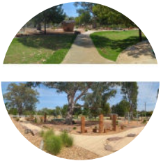
Belvoir Park Stage 2 City of Wodonga