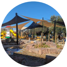
Peter Scullin Reserve Playspace Renewal Kingston City Council + Leaf Design Studio