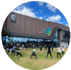
Brimbank Collective Impact Initiative Brimbank City Council