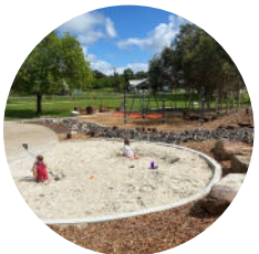
Cororooke Playspace Colac Otway Shire Council