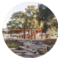
Redleap Reserve Playspace City of Whittlesea