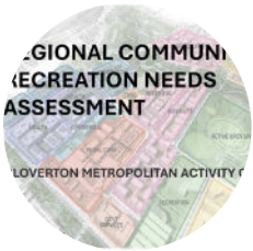
Cloverton Regional Community and Recreation Needs Assessment City of Whittlesea, Hume City Council + Mitchell Shire Council