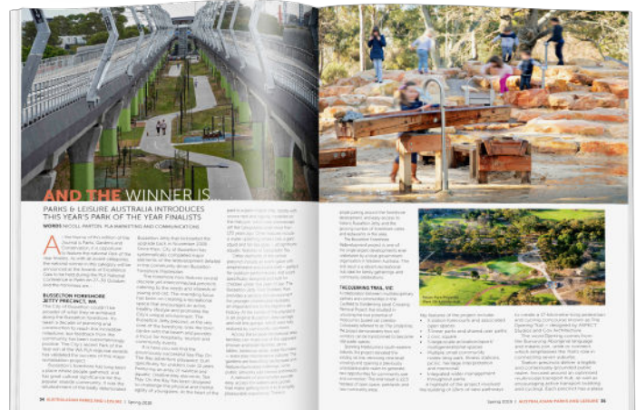
DPS Project Profile