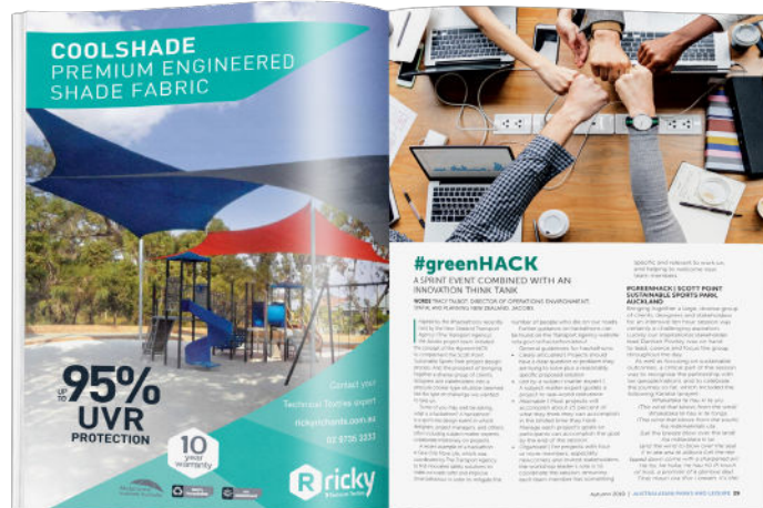
FP Product Profile