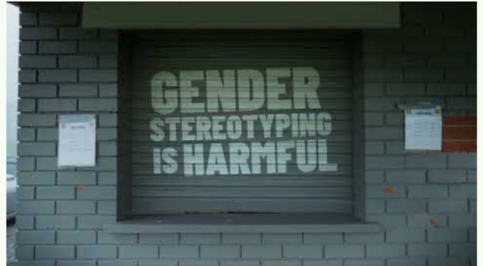
Gender Stereotyping is Harmful - Prevention of gendered violence in sport campaign