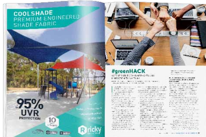
FP Product Profile