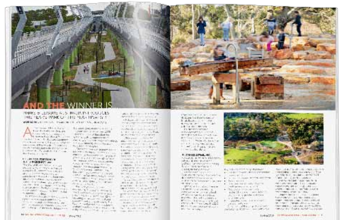
DPS Project Profile