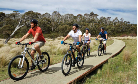
Illustration by Gregory Baldwin.