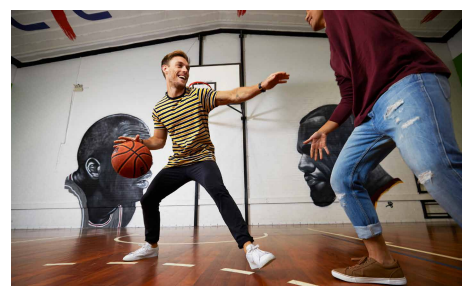
Illustration by Gregory Baldwin.