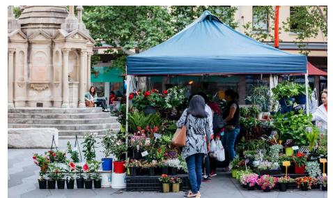
Illustration by Gregory Baldwin.